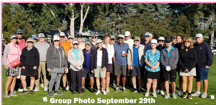
Group Photo September 29th