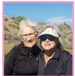
shots. See that hill behind us? Judy lost three balls in there!