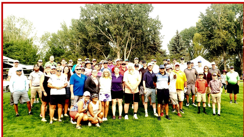
Wounded Warrior Project Golf Tournament was held Saturday, September 10th at Carson Valley Golf Course. Almost $12,000 was raised to help wounded veterans work on getting their lives back together!